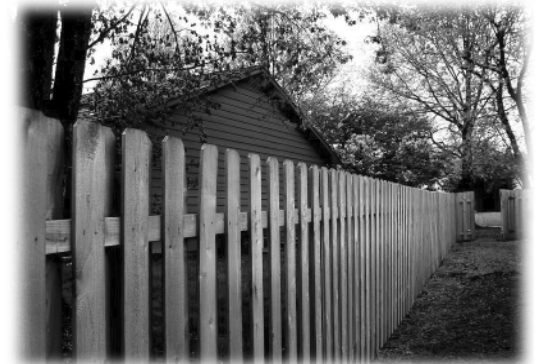
Cedar Privacy Fence

We are specialists in the installation of the world's most durable exotic hardwood; Brazilian Ipe. This amazing wood is wonderful "Green" building product due to its ultra low maintenance properties, 50+ year lifespan and sustainable reforestation. IPE has natural decay resistance superior to that of cedar or redwood and does not contain dangerous chemical preservatives. IPE is incredibly tight grained, dense and strong; a 1x6 IPE deck board will easily span 24" o.c. IPE is more cost effective than you may think. IPE decking costs about the same as equivalent grades of cedar, redwood and most composite deck materials. The most inexpensive deck is ACQ Pine. However, the beauty, refined look and amazing durability of Brazilian Ipe is the lowest cost and most rewarding in the long run.