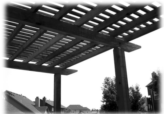
Rough Cedar Pergola